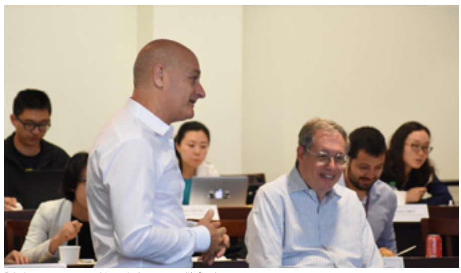
Scholars are encouraged to actively engage with faculty.

from the University of Chicago. He is the coauthor of Game Theory and the Law .